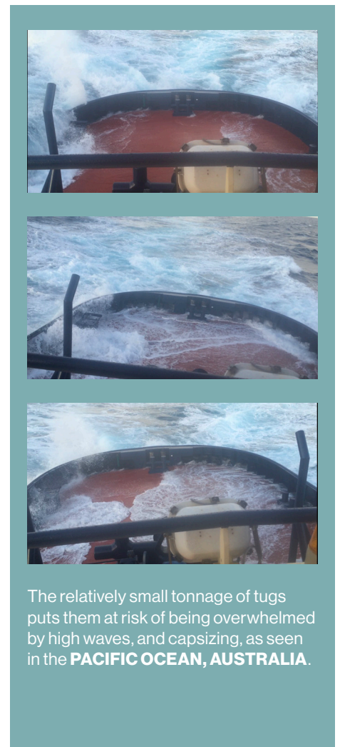
The relatively small tonnage of tugs puts them at risk of being overwhelmed by high waves, and capsizing, as seen in the PACIFIC OCEAN, AUSTRALIA .

In addition to fatigue, the risk of accidents and injuries is increasing through a gradual, but persistent, squeeze on important capital and safety budgets. While a client might think that their act of saving ‘just a few dollars here’ or ‘a few euros there’ in contracts with tug operators has little impact, the aggregate outcome is an industry competing through sizeable cutbacks on maintenance, deferred investment in reliable equipment, delayed renewal of fleets so they are fit for purpose, and inadequate training for crew. The aggregate outcome is less reliable tug services, with corners being cut, and lives being lost.